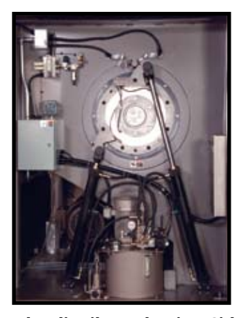
Hydraulic Tilt Mechanism Side